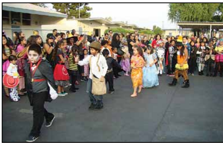
Students participate in the Halloween Parade during our Fall Read Night.

Grade levels also met school wide challenges set for them throughout the year. First, both 4th and 5th grade met quarterly Basic Math Facts Challenges and