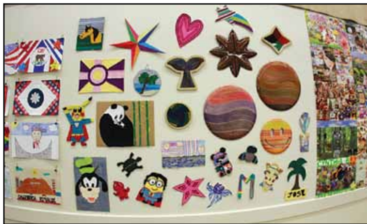
Students' art work on display at our Art Gallery Showcase.

earned trips to Baskin Robbins for their hard work. Next, 3rd grade students researched famous people in history and participated in a gallery walk interview session. Together we are achieving our goals.