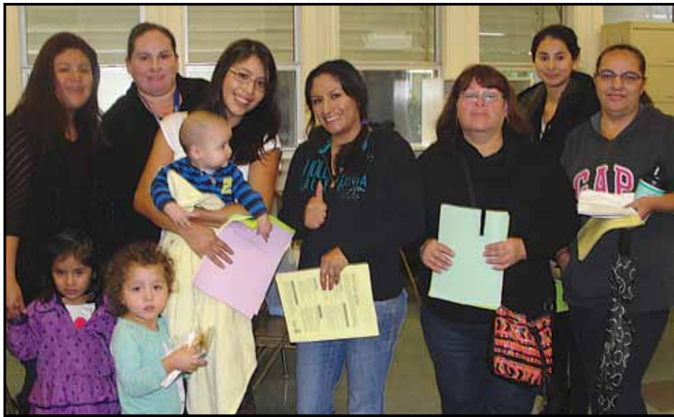
Parents pledge to foster a bully-free environment.

The Mokler Pilots pledge to be bully free! Students spent the first week in December participating in activities to speak up against bullying. The week kicked off with a school wide assembly on Monday morning bringing awareness to the issue of bullying. Additionally, daily activities and classroom lessons taught by the school counselor reminded students and staff to be kind, friendly, speak up and stand up against bullying. The students created signs, posted them around the school and used their most powerful weapon...their