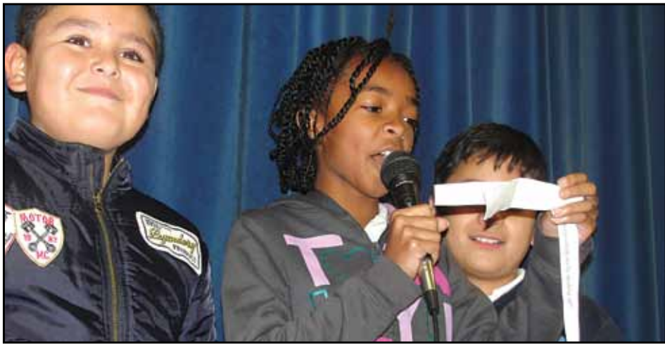
Students speak up against bullying.